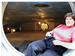
Our beloved Rabbi lounging up in the sky in PSJC's Rose window during the 2005 renovation